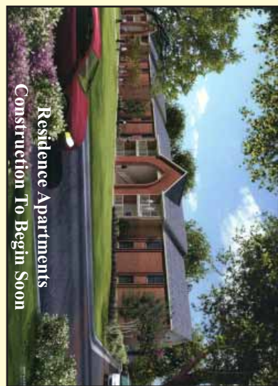
Residence Apartments Construction To Begin Soon