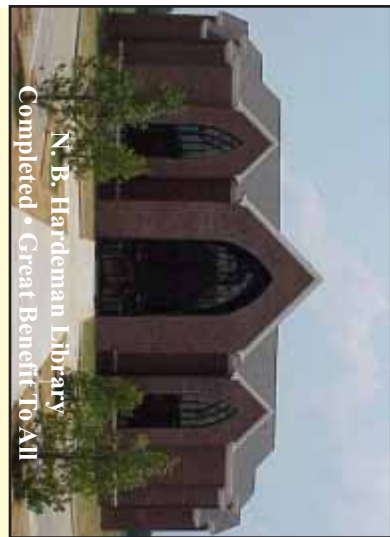
N. B. Hardeman Library Completed • Great Benefit To All