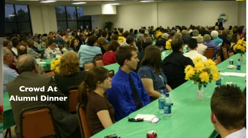
Crowd At Alumni Dinner