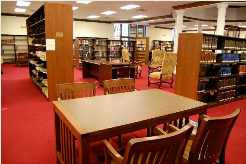
REFERENCE STUDY AREA

The work and the needs of a library are never complete. We have approximately 10,000 books that have been donated but are yet to be cataloged. We appreciate every book that is donated; understandably, it takes time to get each item on the shelf and