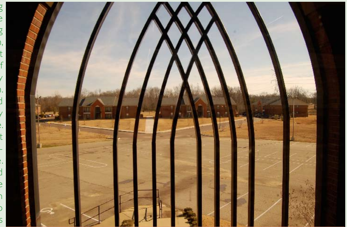
A VIEW, FROM THE LIBRARY, OF THE NEW STUDENT HOUSING

We have a climate-controlled room for valuable archival and special collection materials. These rare items from that area are not available for general use, inasmuch as they require special handling in order to prevent deterioration as much as possible. We encourage friends