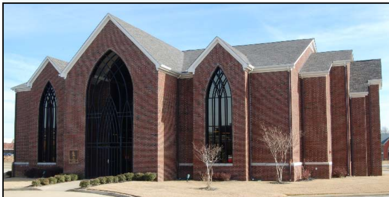
THE N. B. HARDEMAN LIBRARY AT THE MEMPHIS SCHOOL OF PREACHING

Our plans for the Library, as outlined in this issue, will cost $100,000. We know we can count on supporters, who see the special need for a well-equipped Library of excellent resource materials, to help us with these funds. Please mark your contributions "For The Library." Thank you, brethren!