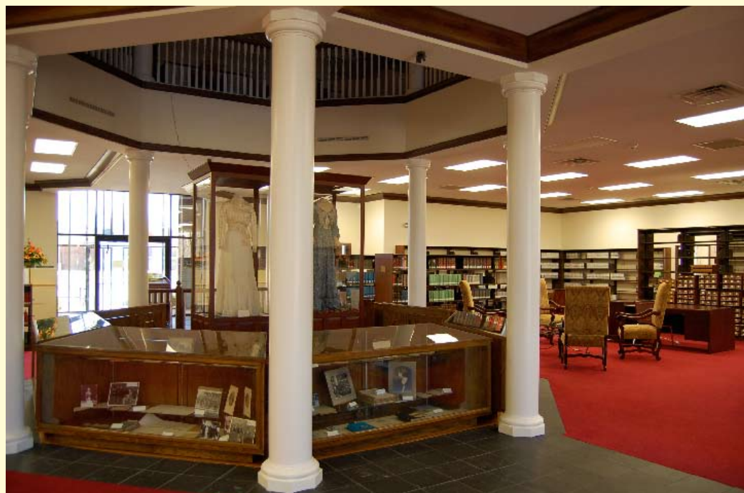
HARDEMAN MEMORABILIA DISPLAY

Our dear friends, please allow me to thank you for your encouragement and support of the Memphis School of Preaching and of the N. B. Hardeman Library. God bless you for investing in the future of the Lord's church.