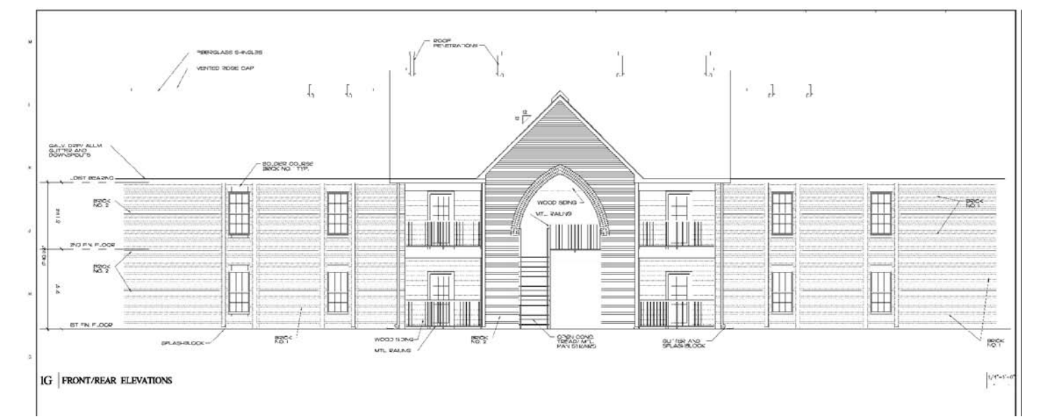
Architect's rendering of the front elevation typical of each of the four MSOP student housing units.

In the long run, this will be a far more efficient use of the Lord's money.We trust the Lord will provide, and that faithful, loving brethren will answer the call, and will generously give to this needed, worthy effort.