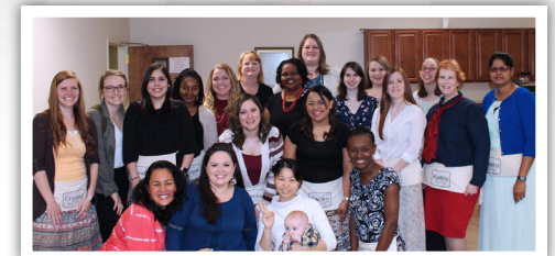
The Student Wives: Thanks for working so hard!