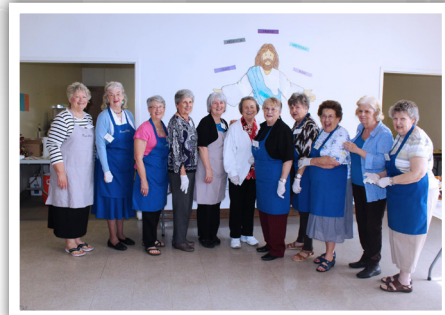
All were grateful for the great work of these ladies at lunch time!