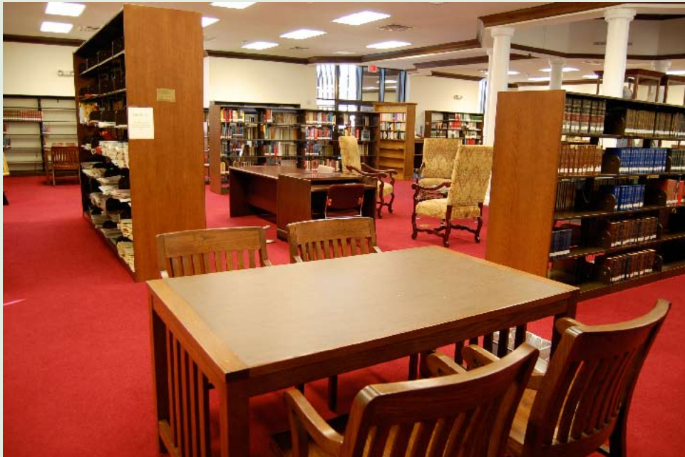
REFERENCE STUDY AREA