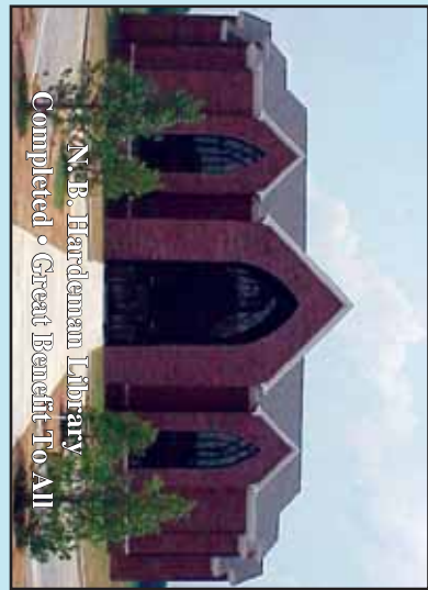
N. B. Hardeman Library Completed • Great Benefit To All